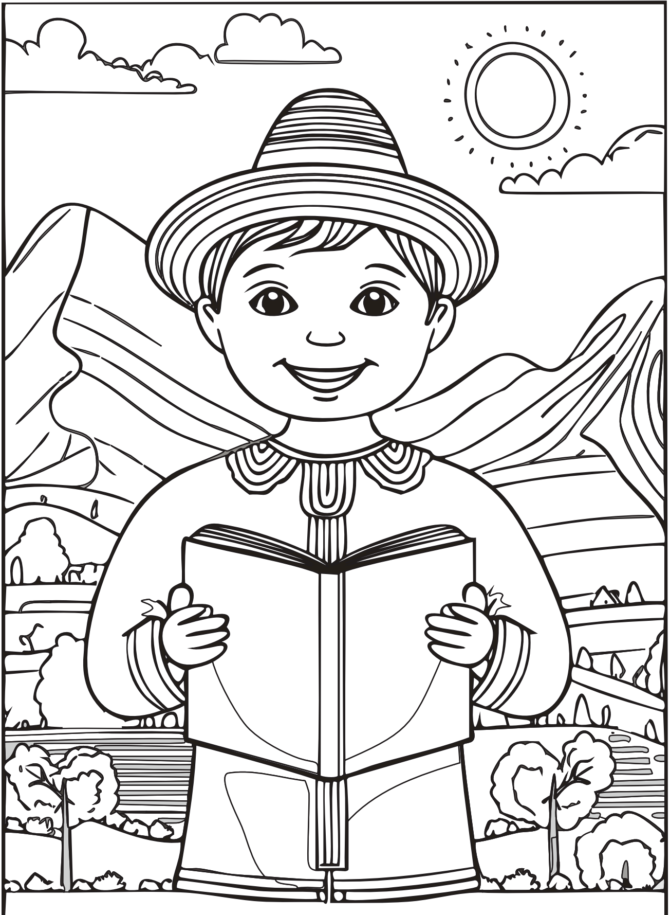
A child in Latin America receives a Bible in his own language for the first time.