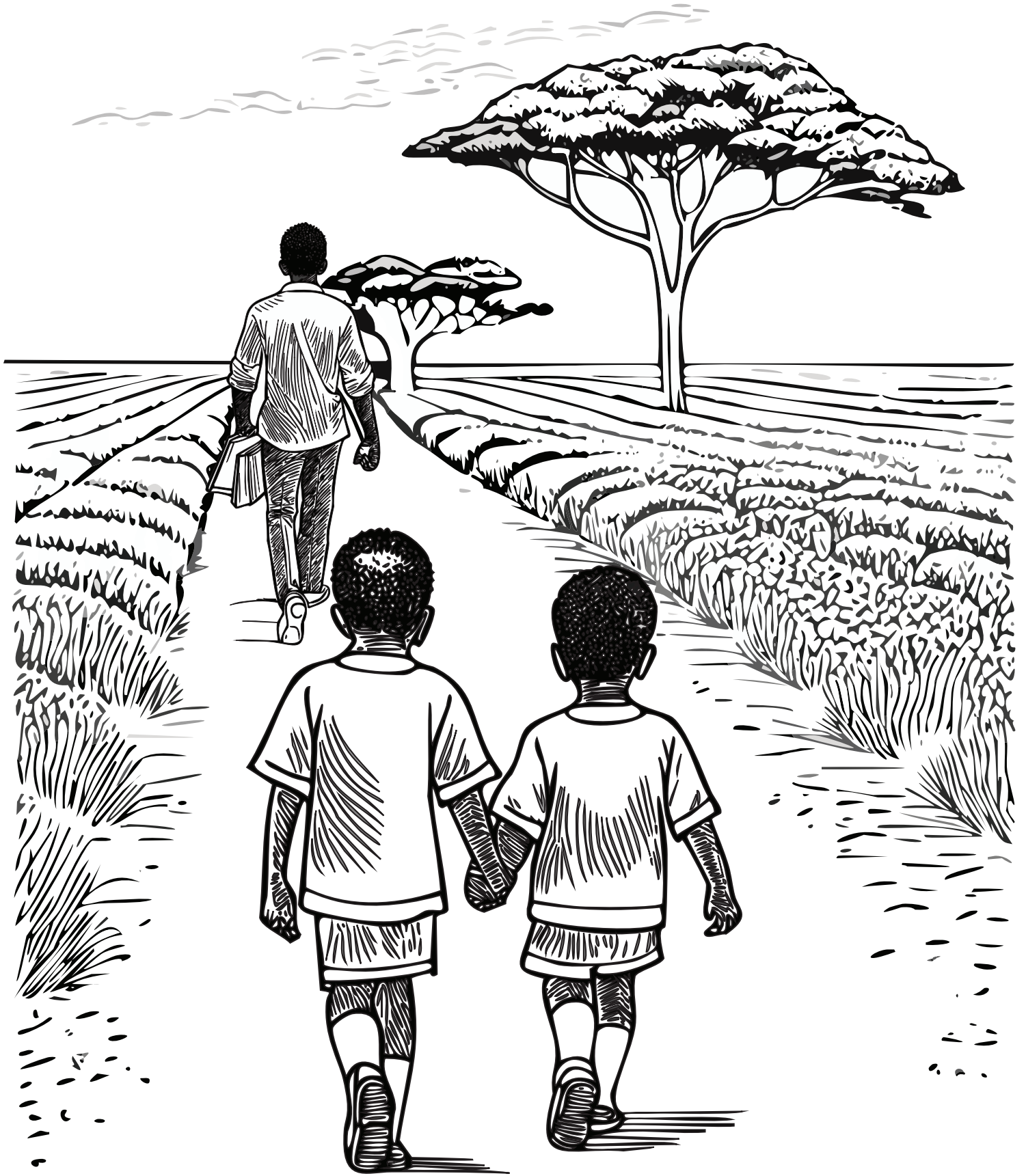
Children in Africa hear the Gospel from pastors who travel to their villages.